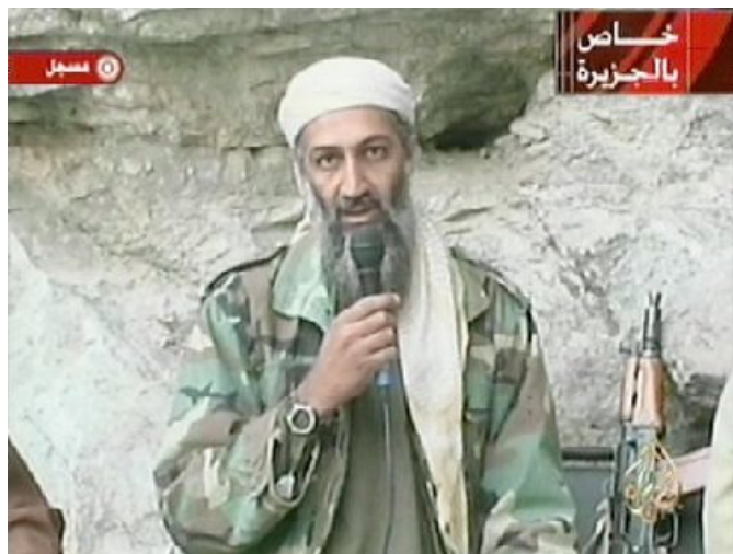
Osama bin Laden is seen in this video footage recorded at an undisclosed location in Afghanistan aired by the Qatar-based satellite TV station al-Jazeera.

NEW YORK (CBS 2) — A terror power shift leads to a stunning warning from the Department of Homeland Security.