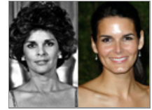
Separated at Birth