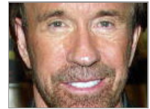
Celebs' Real Names