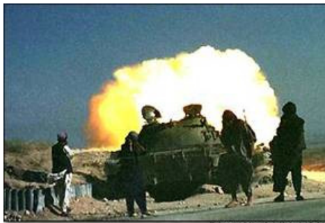
Taliban militiamen watch as one of their tanks light up an opposition position northeast of Kabul on Aug. 15.