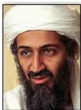
Exiled Saudi dissident Osama bin Laden is seen in this April, 1998 photo in Afghanistan.

In fact, while he returned to his family's construction business, bin Laden had split from the relatively conventional MAK in 1988 and established a new group, al-Qaida, that included many of the more extreme MAK members he had met in Afghanistan.