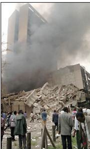
Passersby look at damaged buildings in Nairobi, Kenya on Aug. 7 after a huge bomb planted next to the U.S. embassy there.

What the CIA bio conveniently fails to specify (in its unclassified form, at least) is that the MAK was nurtured by Pakistan's state security services, the Inter-Services Intelligence agency, or ISI, the