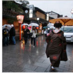
Kyoto, the Imperial City, Grapples With Its Image