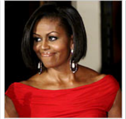
Can Michelle Obama Make You a Star?

Glenn Greenwald and David Frum debate whether President Bush was right on national security.