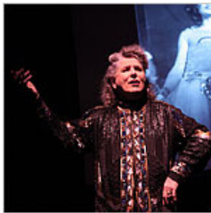
At St. Ann's Warehouse, Youth, Frocks and Politics