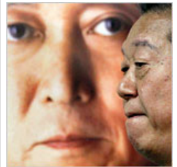
U.S. Reaches Out to Tokyo's Real Power

Home | World | U.S. | N.Y. / Region | Business | Technology | Science | Health | Sports | Opinion | Arts | Style | Travel | Jobs | Real Estate | Autos | Back to Top