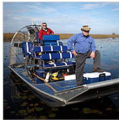
In Deal on Everglades, a Dream Is Deferred