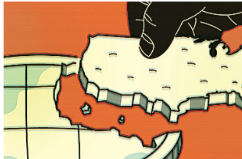
Illustration by Harry Campbell for TIME ENLARGE +