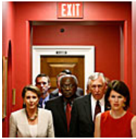
The Global Financial Crisis